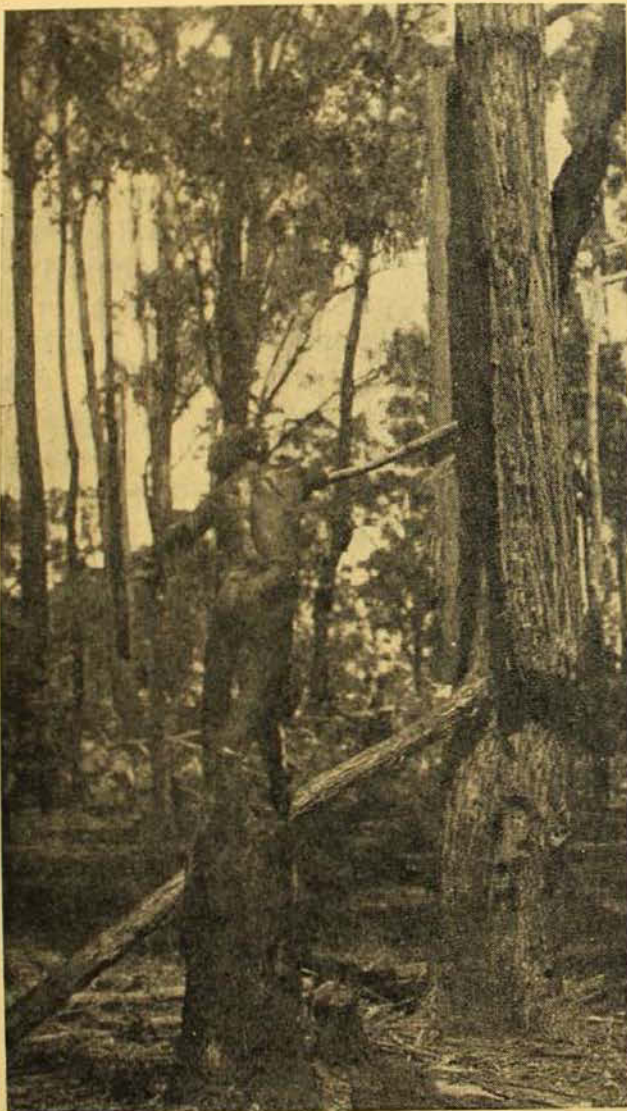
The aboriginal, standing on a sapling as a ladder, is levering the cylinder of bark from the tree trunk.

The swamp mahogany, red gum, river gum and stringy-bark trees provided the bark in suitable sheets of the large size required. One man climbed the tree to a height of eighteen or twenty feet, or to where it was considered the bark would lift, and with his axe cut a groove through the bark right round the trunk. In the meantime his companions cut a similar groove several feet above the ground, and he cut a vertical one, to link the two encircling grooves, as he descended the tree. In some localities the rough bark was chipped off with a sharpened stick, while the sheet was still on the tree, but in other places, as at Port Macquarie, it was removed subsequently. The flattened end of a pole was then inserted between the bark and the trunk, and by pressure upon this lever the cylindrical sheet of bark was loosened and eased off the tree. To make the bark pliable it was heated over a long open fire, or a bundle of sticks and leaves was lighted inside the cylinder, which was tied at each end and rolled about to