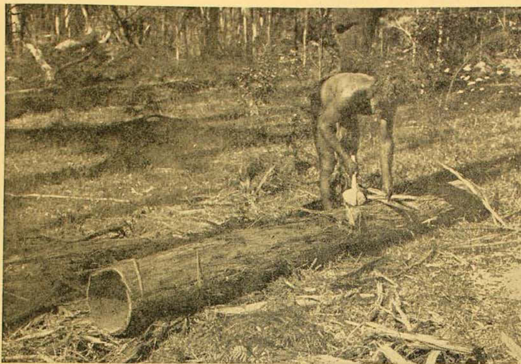
The "rough" of the bark is trimmed off with a stone axe.