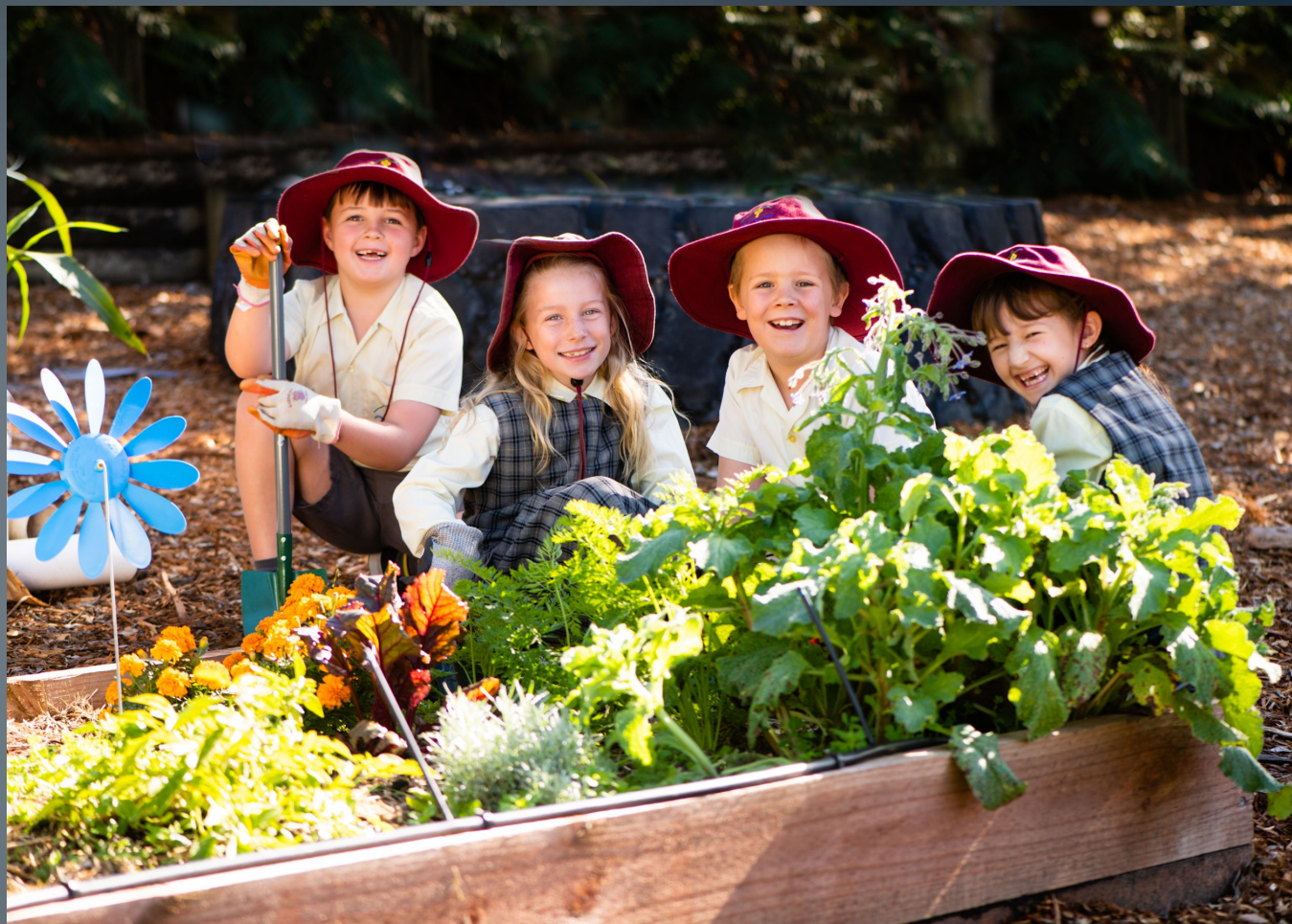
Holy Cross Catholic Primary School Kincumber