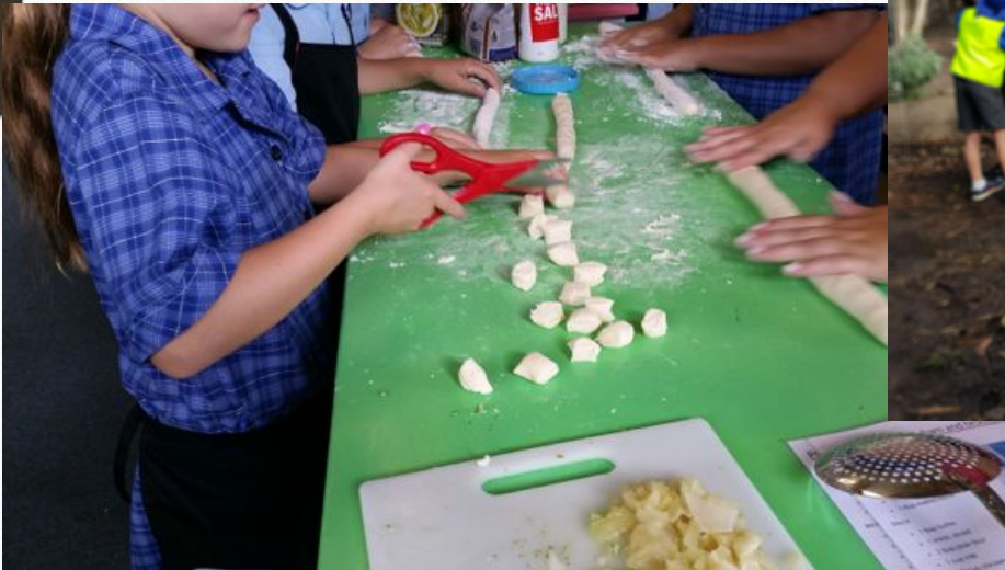
Reading a recipe to make gnocchi

The students use grow and harvest food in our garden to create a variety of seasonal dishes.