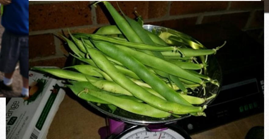
weighing freshly picked beans for a recipe